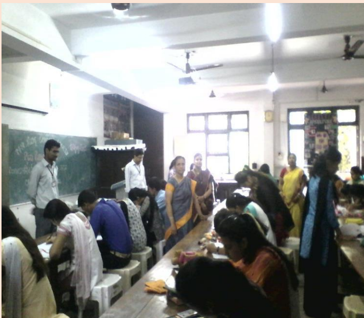
Best out of waste Exhibition