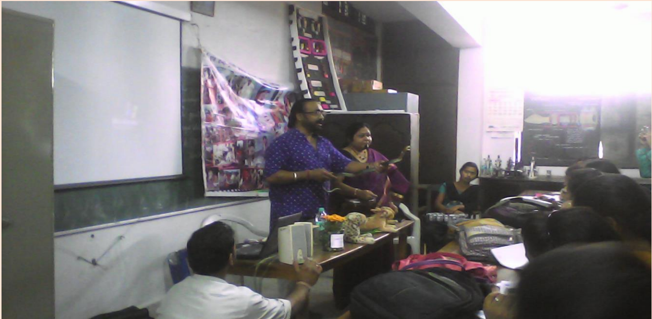
Judgement of poster Competition