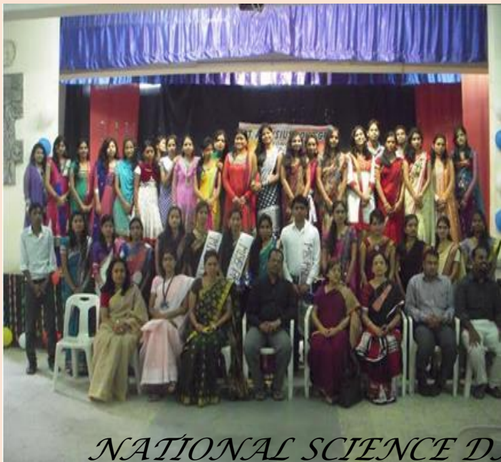
NATIONAL SCIENCE DAY CELEBRATION 2013-14