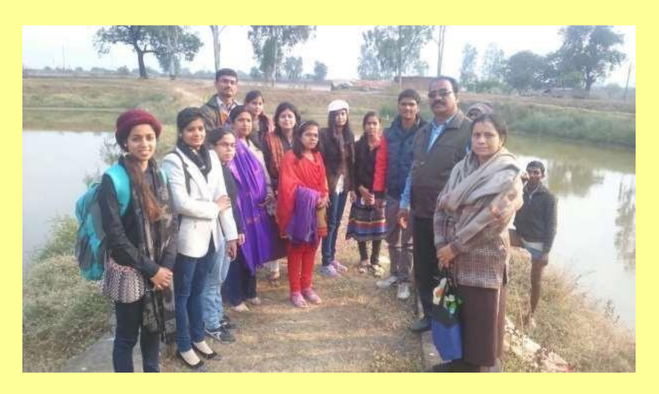
Educational Trip To Biodiversity Spot at Gotegaon -20th March 2016