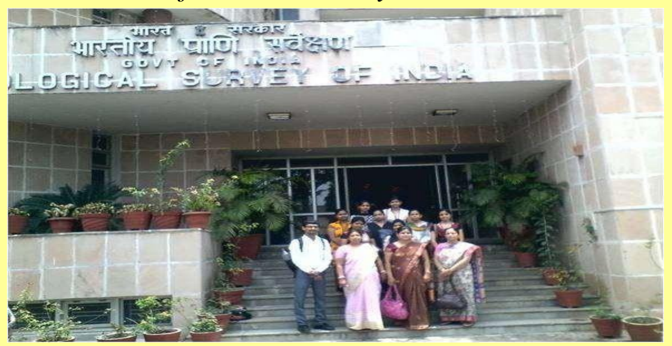
07 days National workshop on "Science and Technology communication" from 4th - 10th Oct. 2015, organized by Govt. Model science College, Jabalpur.