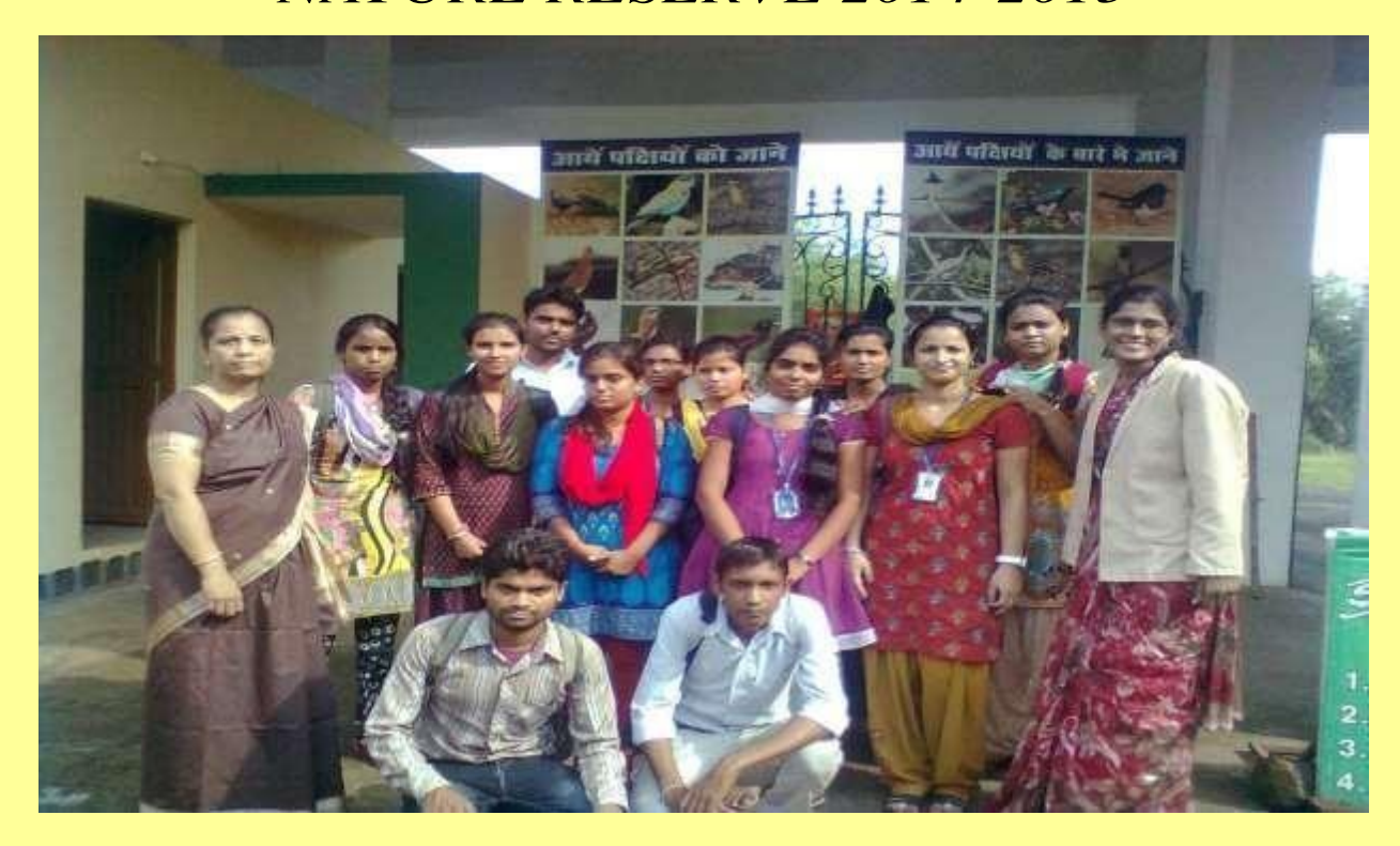
BIODIVERSITY CONSERVATION AWARENESS PROGRAMME IN DUMNA NATURE RESERVE 2015-16