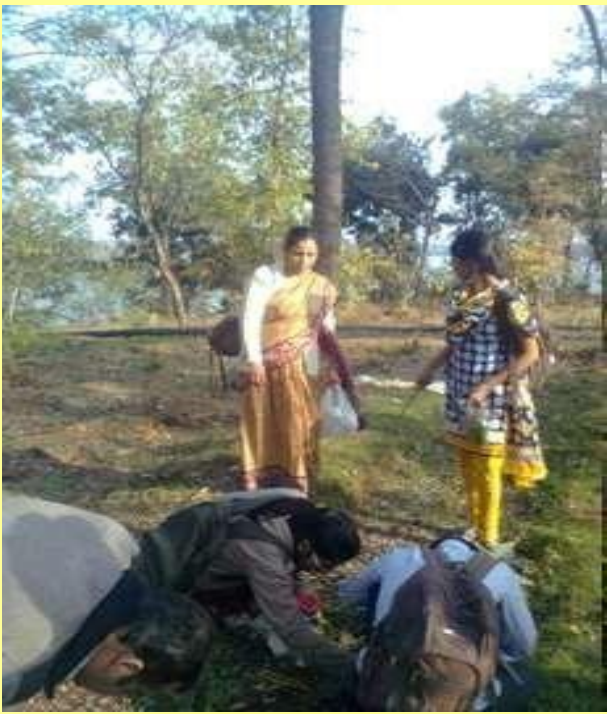
Educational Trip to Katav [M.P]-2014-15