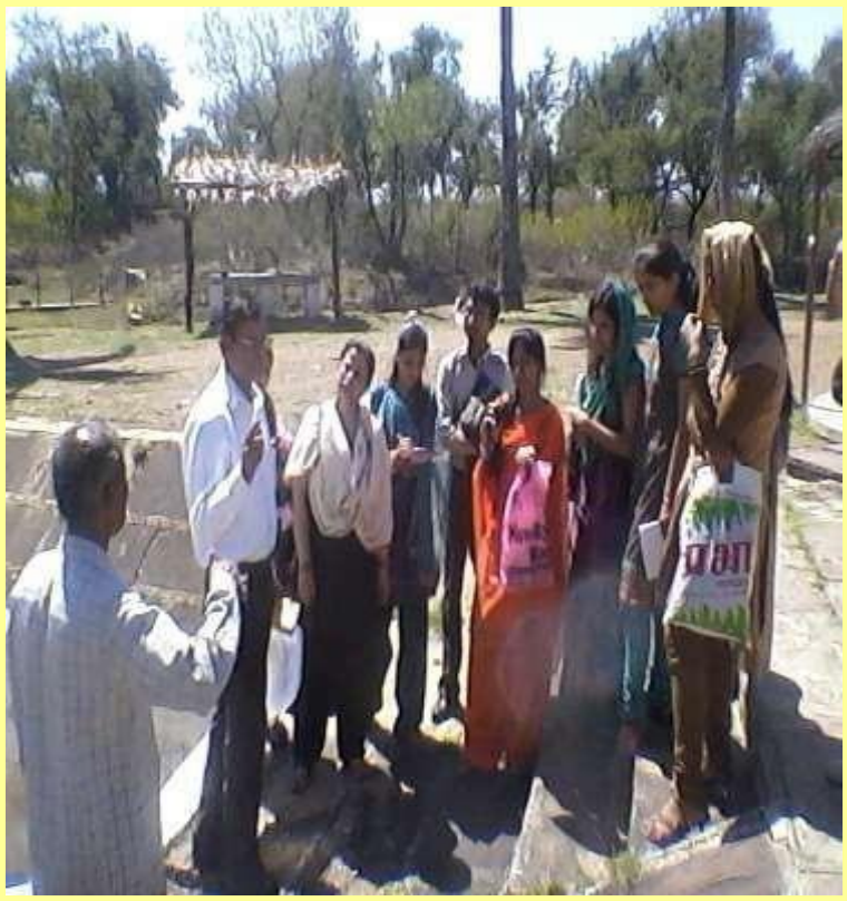
Educational Trip to Rani Durgawati Sanctuary and Singhorgarh Fort at Singrampur(M.P.) 2013-14