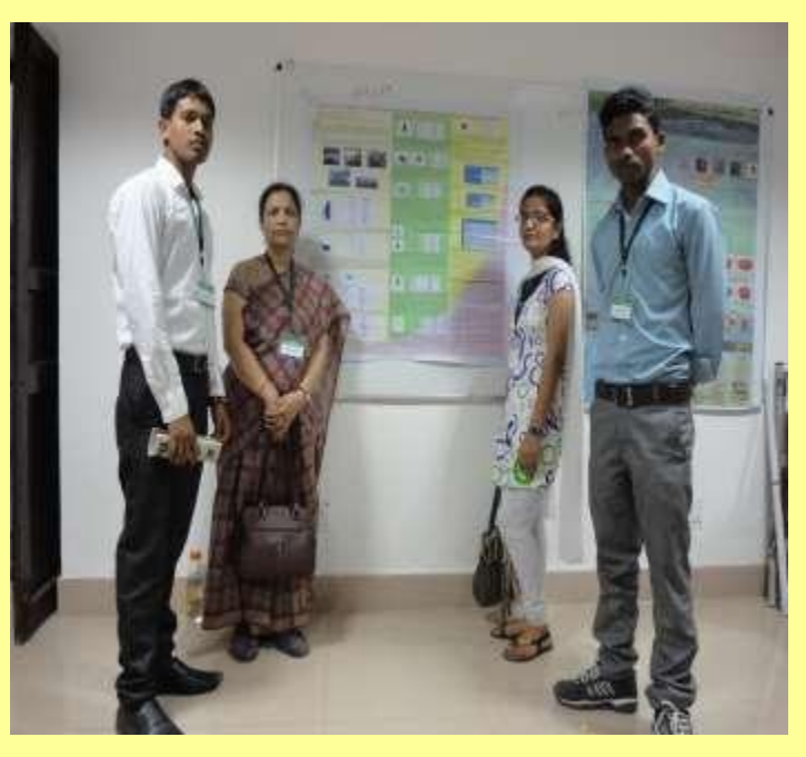
PG Zoology students and faculty members attended International Conference on 22nd – 23rd March 2014 at Lucknow University