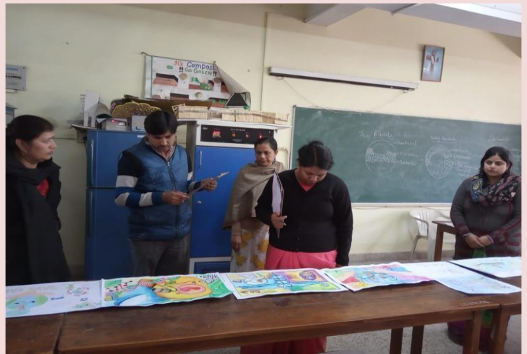
Collage Competition on the theme “Man and Ecosystem” on 09.02.2019