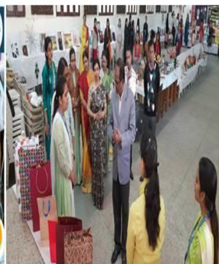
ART & CRAFT EXHIBITION