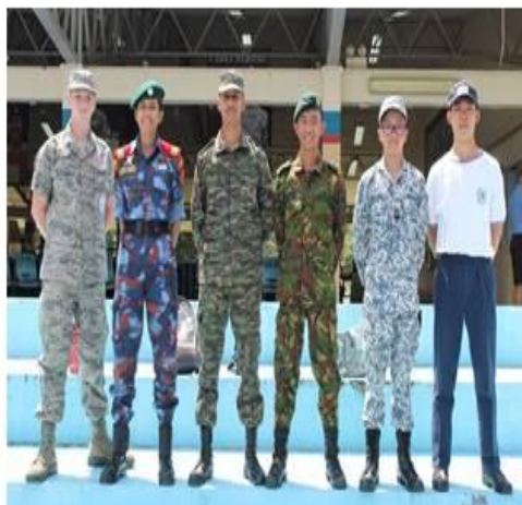
YOUTH EXCHANGE PROGRAMME