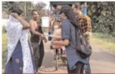
एनएसएस की छात्राओं ने बांटे मानक

जयंती के अवसर पर शहर में विभिन्न कार्यक्रम आयोजित किए गए और इसी कड़ी में सेरा कॉलेज जबापुर में छात्रों ने मां से बहकर शरीर को सेवा की और गांधीजी को याद किया। सेंट अलॉयसियस की महाविद्यालय की श्रेष्ठ सेरा योग्यता की छात्राओं ने रात में मानक बंदरगाह में गांधी से सम्बंधित अधिष्ठापन प्रदर्शन मनाई गांधी जयंती। समय से स्वच्छ शरीर में देखा का काम होता है, कुछ ऐसे ही उद्योग को लेकर आज इन छात्राओं ने गांधी जयंती के अवसर पर सम्बंधित अधिष्ठापन और मानक विवरण अधिष्ठापन प्रदर्शन। रात ही मंगल रातोंको स्वच्छता की रात में दिवस। विहित हो की श्रेष्ठ सेरा योग्यता दिवस का