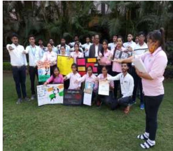
परिषदेयता के तहत इस विधि में स्थितान द्वाढा अनन्य वाकान एषाई, काव,एष, भाई का विशेष योगदान रहा।