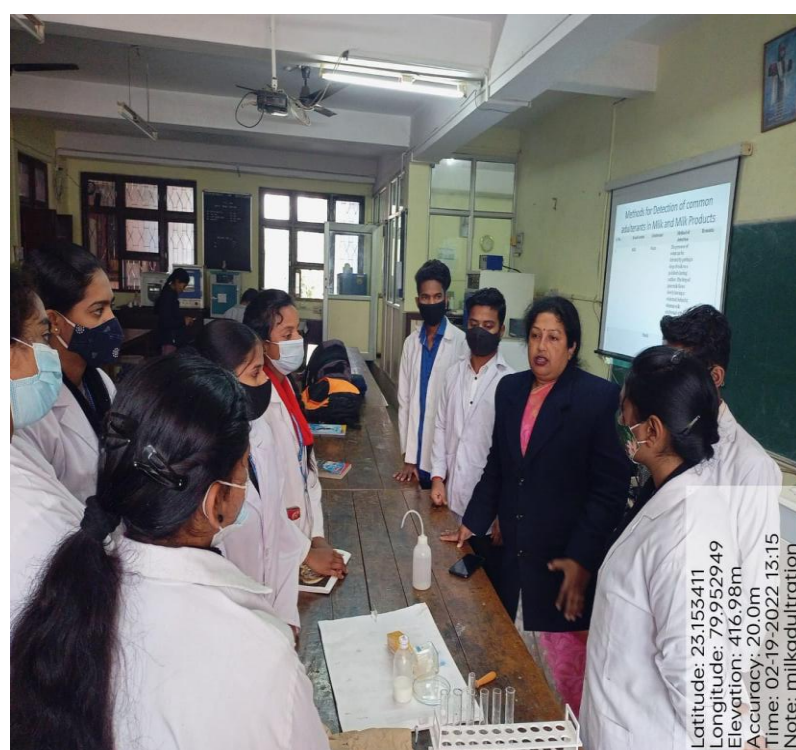
Experiment on adulterants of milk samples