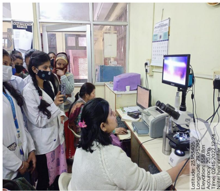
Experiment on comparative hair profile study in mammals with the help of phase contrast