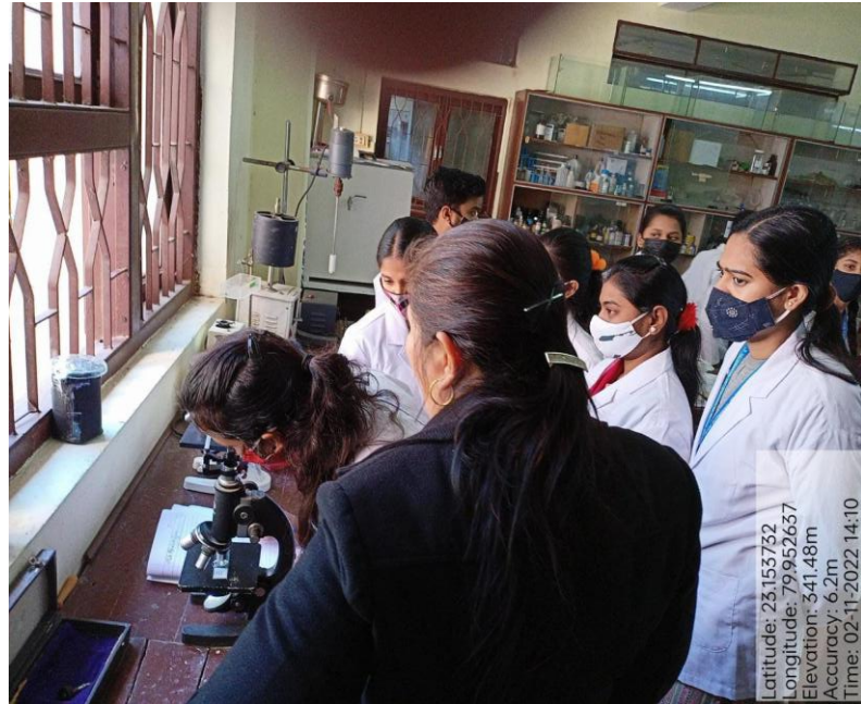
Experiment on drawing using camera lucida