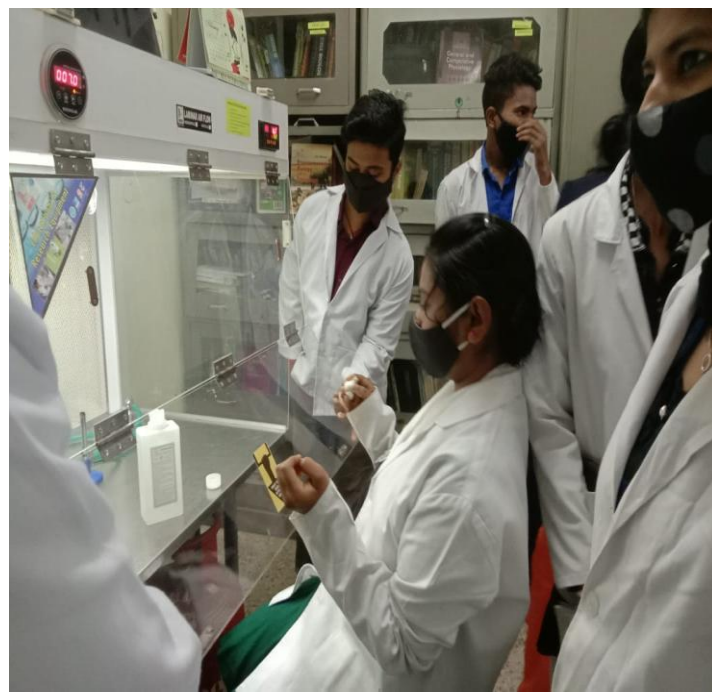
Experiment on antibacterial activity of cow urine