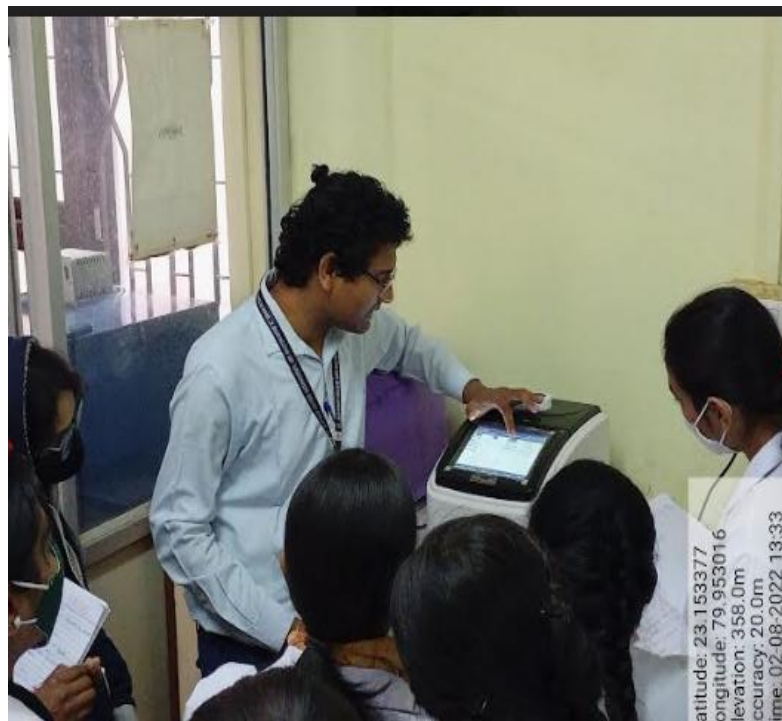
Demonstration of Principle, working and application of PCR