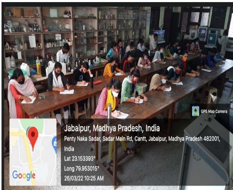
Offline examination of certificate course held on 26 th March 2022