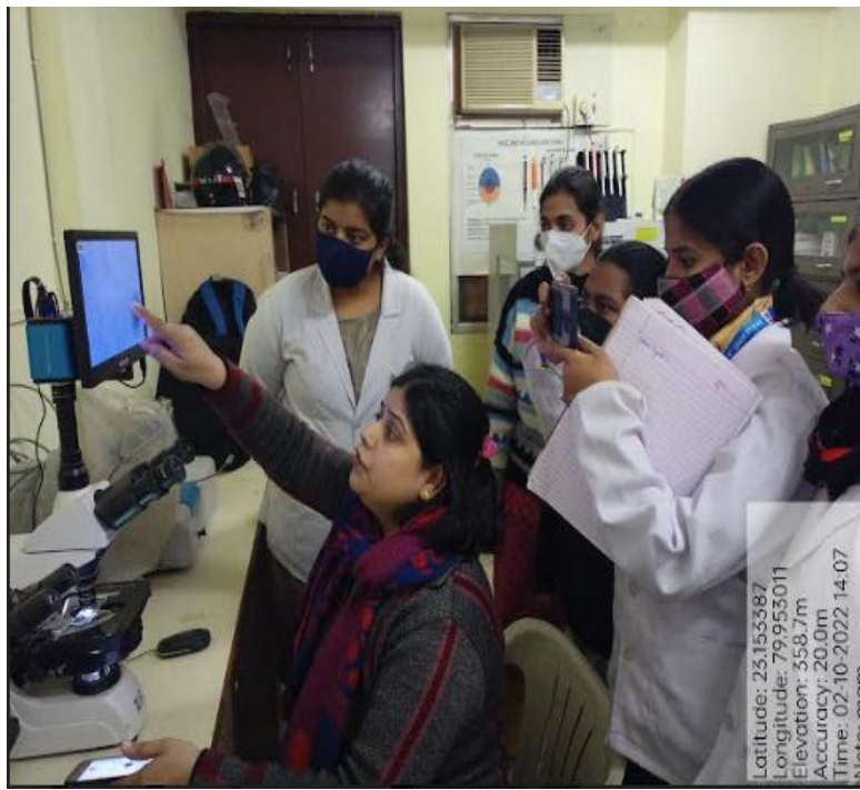
Experiment on total haemocyte count in insect haemolymph using phase contrast microscope