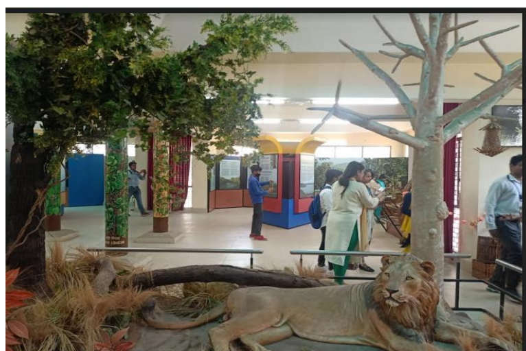
A Visit to Research Institute on 1/4/2022 – TFR I (Tropical Forest Research Institute, Jabalpur)