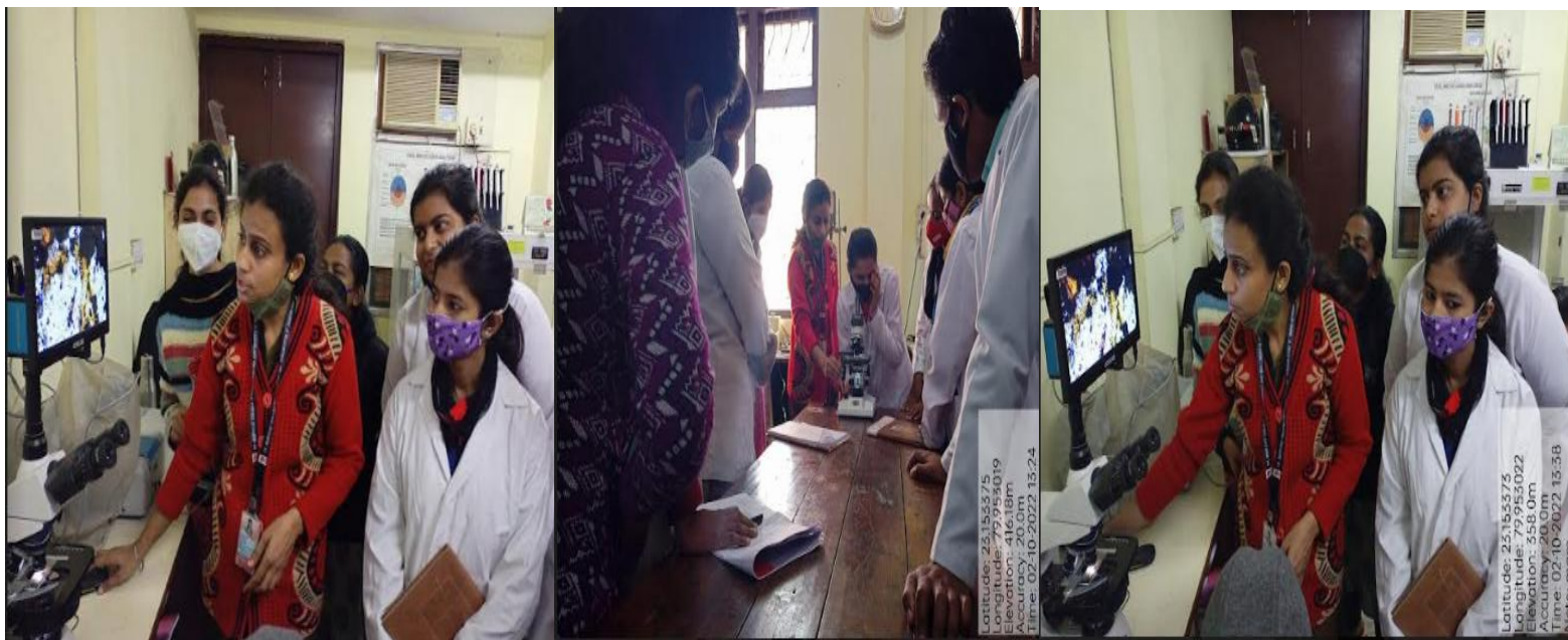
Experiment on haemin crystals in human blood using phase contrast microscope