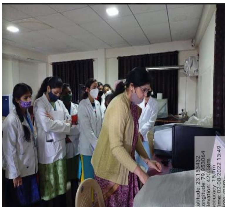
Demonstration of Principle, working and application of FTIR