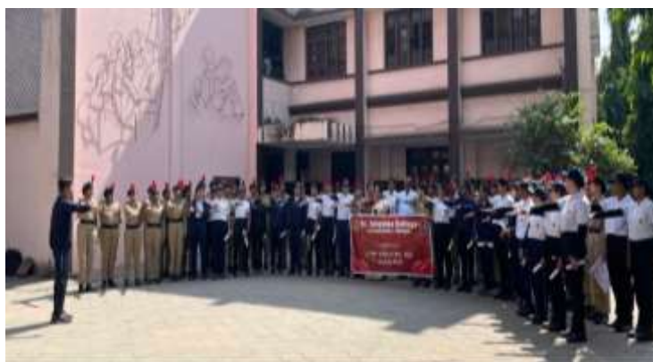
Image: Pledge Taking Ceremony