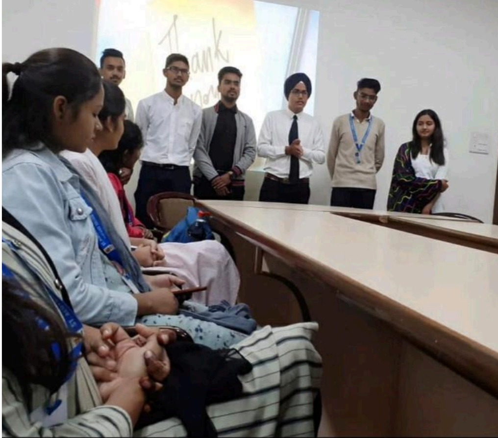
Entrepreneur Skill Enhancement Business Idea Presentation