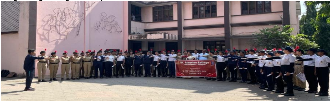
Image: Pledge Taking Ceremony