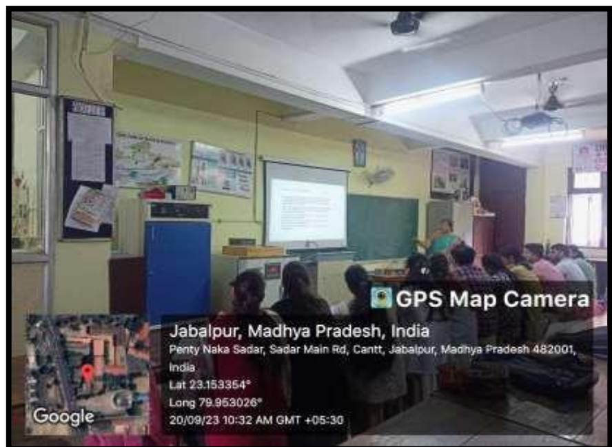
Online/offline lecture on Microtomy