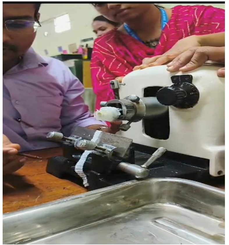
Preparation of the ribbon of the sample by microtome