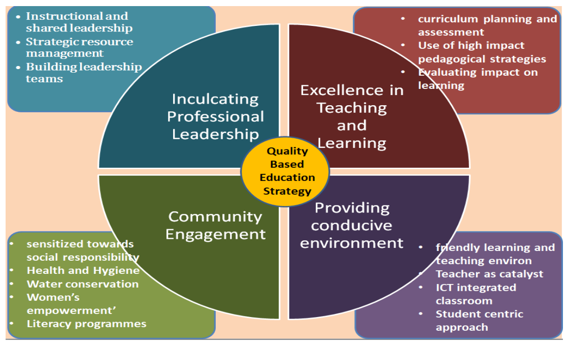
Quality based Education Model