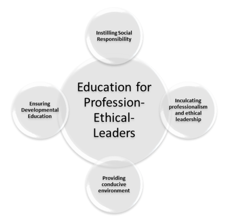
Fig: Education for Profession-Ethical-Leaders Model