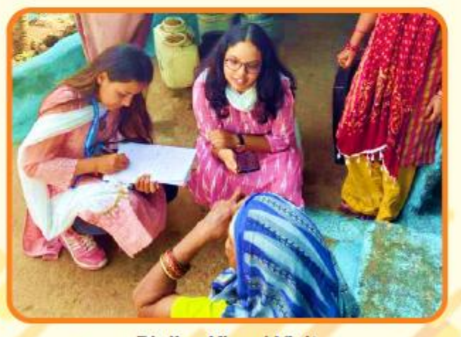
Pipliya Khurd Visit