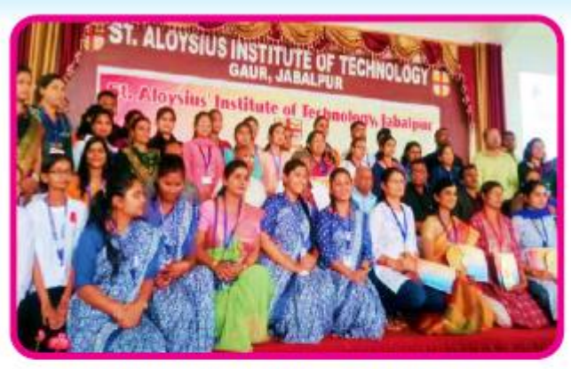
St. Aloysius' Institute of Technology