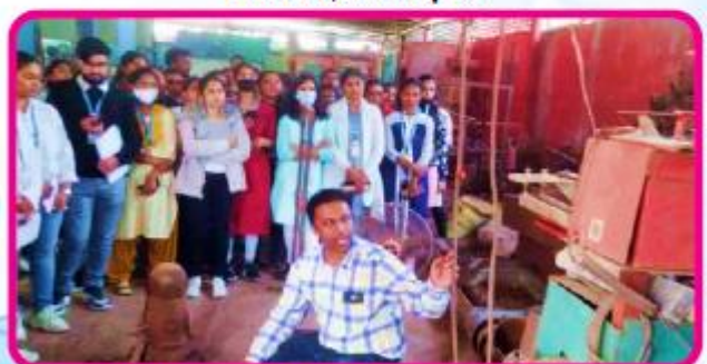
Jabali Paperworks and Steelace Industries