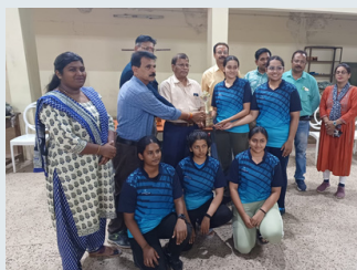
20th Sep. 2023: Winner of Inter-Collegiate Badminton (Men & Women) competition