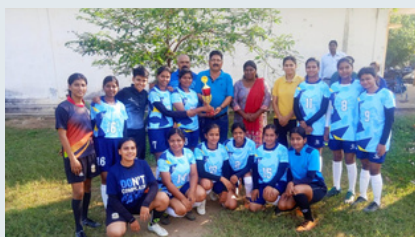
8th Oct. 2023: Football (Women) team stood winner in Inter Collegiate competition