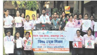
A view from the awareness programme on 'AIDS'.