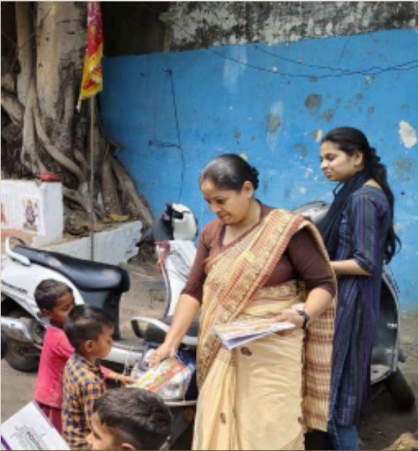
Spreading happiness - Notebook and Clothes distribution by The students of BCA II & IV Semester.