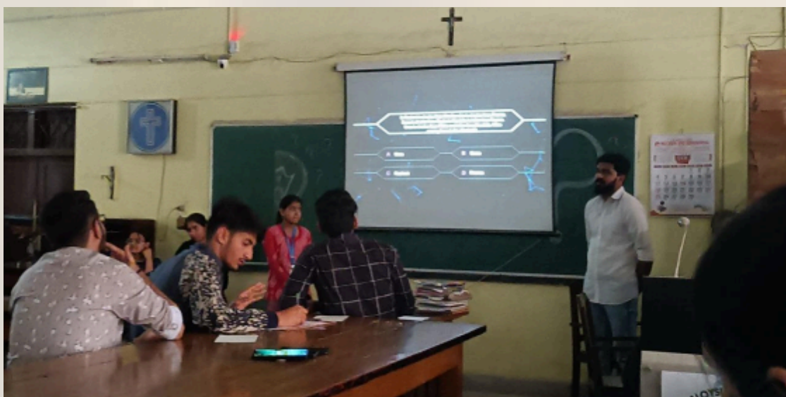
On the occasion of National Science Day, Department of Physics along with science club organized National Science Day Celebration 2023-24